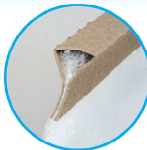
Pinch Frame Design